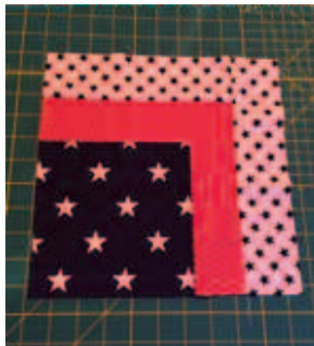
finished block - 10-1/2 inches