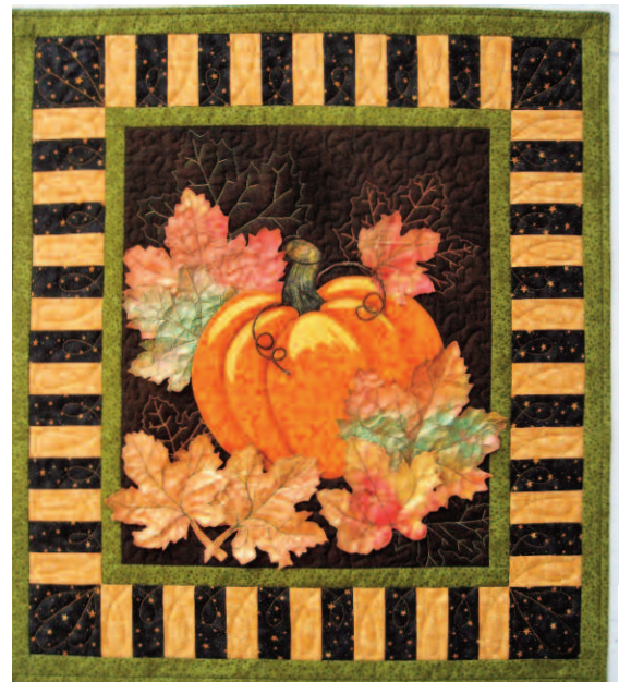
Pumpkin Wallhanging with Tyvek Leaves